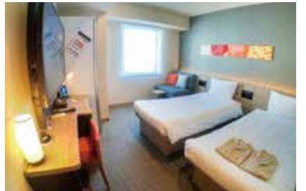
【Deluxe Twin Room】