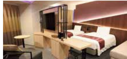
【Corner Suite Room】

Guest Room (Wi-Fi in all guest rooms and all guest rooms are nonsmoking) Total of 217 guest rooms