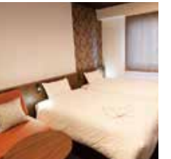
【LG Styler Room/Twin Extra】