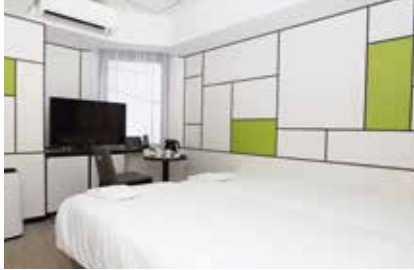
【Hollywood Twin Room】