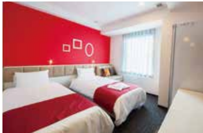
【Deluxe Twin Room】

Guest Room (Wi-Fi in all guest rooms and all guest rooms are nonsmoking) Total of 98 guest rooms