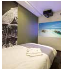
【Theater Room Semi-Double】