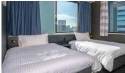
【LG Styler Room/Twin】

Guest Room (Wi-Fi in all guest rooms and all guest rooms are nonsmoking) Total of 145 guest rooms