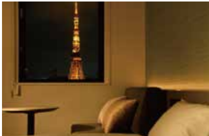
【Tower view Deluxe Twin/ high floor】

Guest Room (Wi-Fi in all guest rooms and all guest rooms are nonsmoking) Total of 118 guest rooms