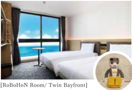
[RoBoHoN Room/ Twin Bayfront]

Guest Room (Wi-Fi in all guest rooms and all guest rooms are nonsmoking) Total of 98 guest rooms