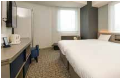
【Standard Twin Room】