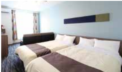
【Standard Twin】(4 guests)