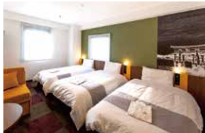
【LG Styler Room/Triple】