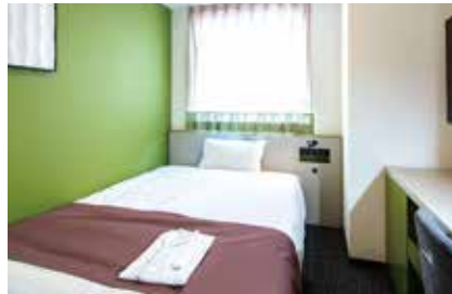
【Deluxe Single Room】