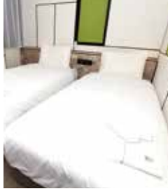
【LG Styler Twin Room】