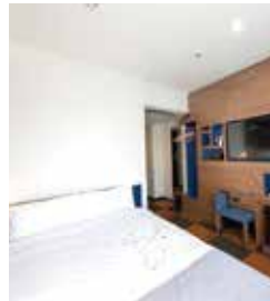
【LG Styler Room/Double】