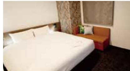
【LG Styler Room/Double】