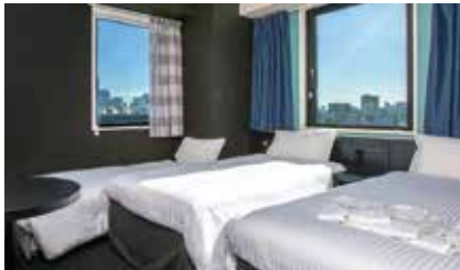
【LG Styler Room/Twin Extra】