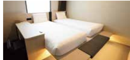
【Japanesque Twin Room】