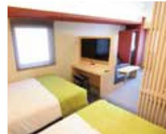
【Family Suite Room】