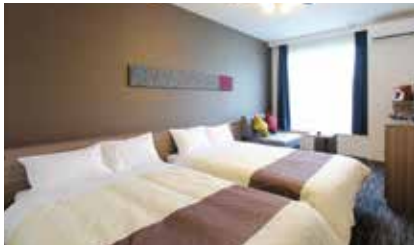
【Standard Twin】(2-3 guests)

Guest Room (Wi-Fi in all guest rooms and all guest rooms are nonsmoking) Total of 100 guest rooms