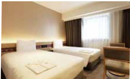
[Superior Twin Room]

Guest Room (Wi-Fi in all guest rooms and all guest rooms are nonsmoking) Total of 104 guest rooms