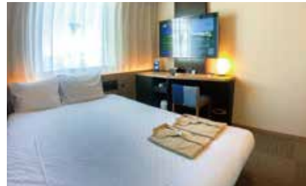
【Standard Double Room】