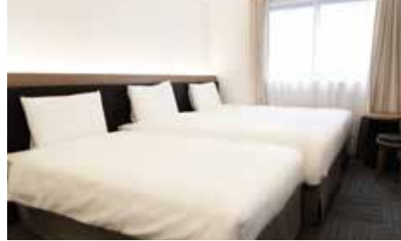
【RoBoHoN Room/ Twin】