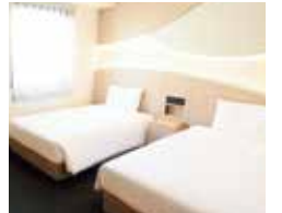
【Deluxe Twin Room】