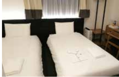
【RoBoHoN Room/ Twin Extra】