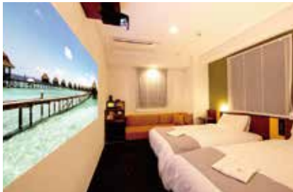
【Theater Room Twin Extra】

Guest Room (Wi-Fi in all guest rooms and all guest rooms are nonsmoking) Total of 200 guest rooms